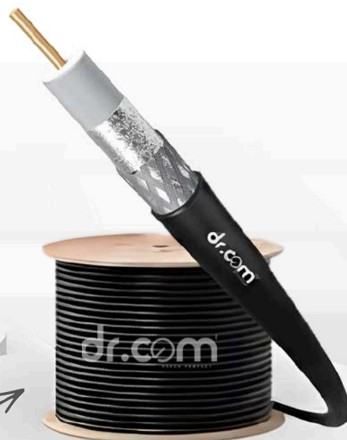
305 Meter Cable Spool Packing