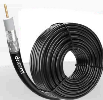
100 Meter Cable Coil Packing