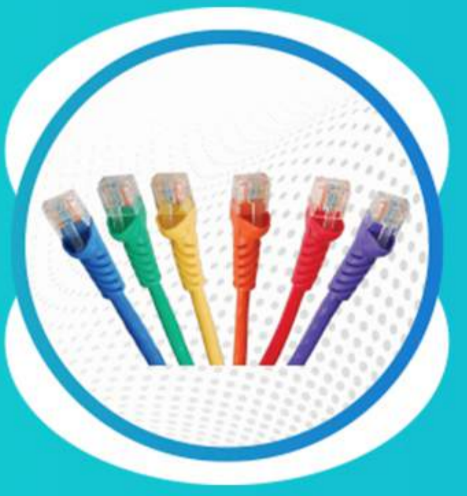
COPPER PATCH CORDS