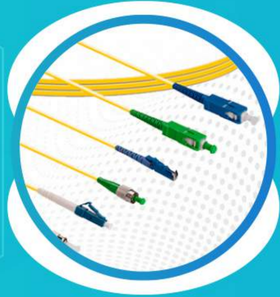
OPTICAL PATCH CORD